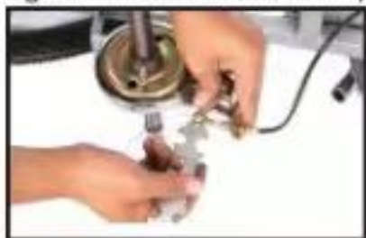
27. Adjust brake properly and fix the nut