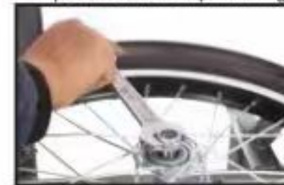
31. Fasten the nut, don't press it too tightly