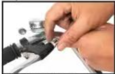
21. Hang brake cable and tighten front aluminum cap