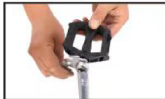
48. Introduce the thread by hand and rotate the left and right pedals towards the front