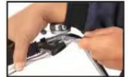
20. Thread brake wire into brake handle along groove