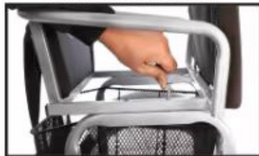
45. Fasten the four screws and nuts