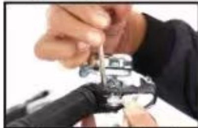
22. Secure brake handle with a wrench