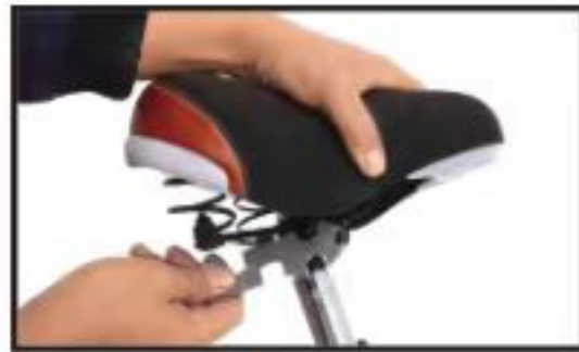
39. Tighten the seat screws