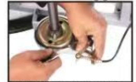
26. Pull the brake wire through the hollow nut