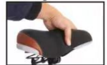
38. Install the seat