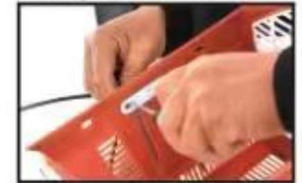
14. Install front basket