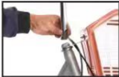
17. Loosen the heart into the front fork