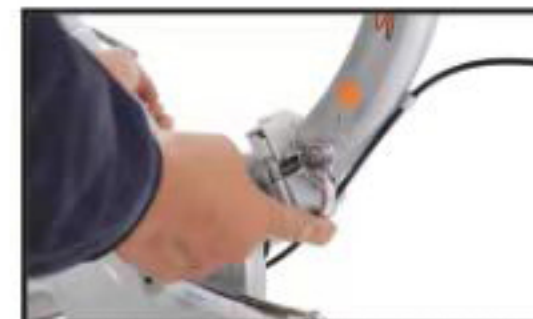
1. Tighten the quick-release screws to secure the handle