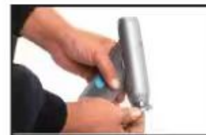
7. Install front fork steel bowl