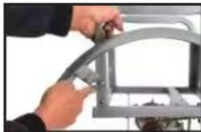
4. Secure the screws