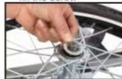
30. Fasten the gasket