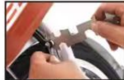
24. Tighten brake cable and fix the screw