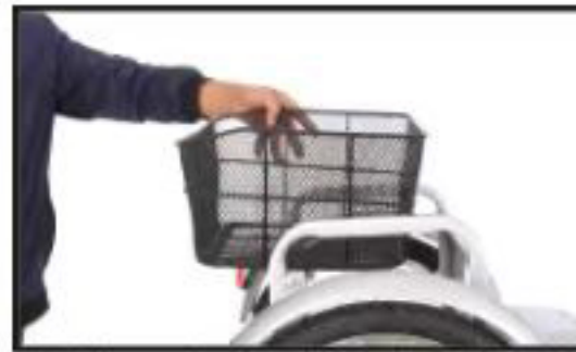
40. Place the back basket with the bend facing back