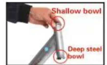
8. Press deep steel bowl below, shallow bowl above