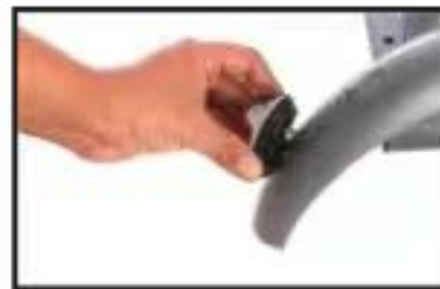
5. Tighten rear tile taillights