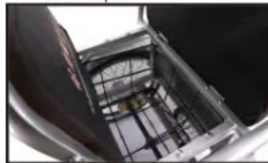
46. Pull up seat plate to place items