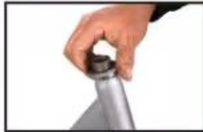
11. Tighten flat cover wire