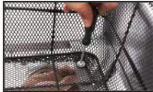
41. Through screws, secure gasket