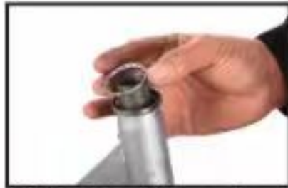
10. Top bead frame plane upward