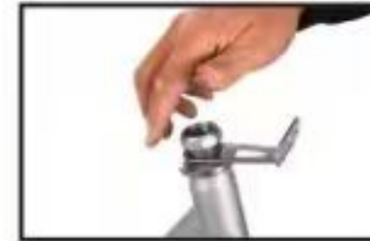
13. Tighten the top screws