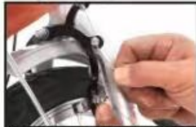
23. Knead front brake into position