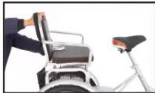
43. Place the rear seat