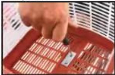
16. Secure iron sheet with two screws