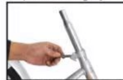
37. Adjust the height and tighten quick disassembly