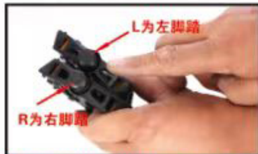
47. Pedal strap "L" with an "R" on the left side of the bike The letters are on the right side of the bike (pedals are on a black iron flat surface Marked with "L" and "R")