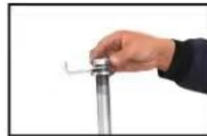
6. Unscrew front fork parts