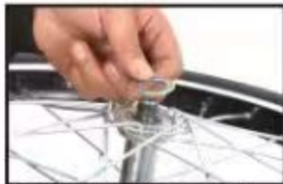
34. Round holes face inward, square holes face outward