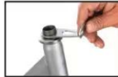
12. Install light fork in groove