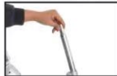
36. Install seat tube