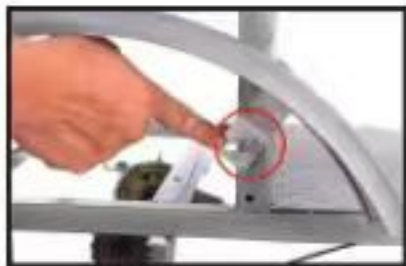
3. Fix the tile and turn the long hole to the end