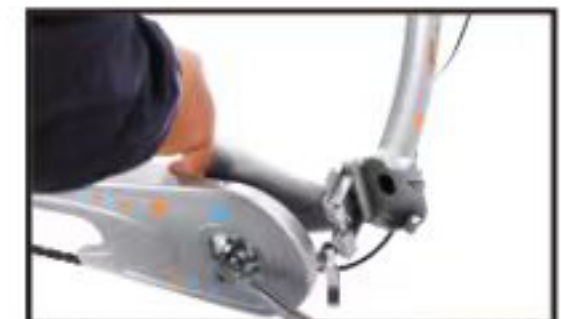
2. Portable quick open, share the folding machine