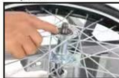
29. Install wheel and load the bearing