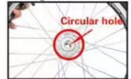
32. The other wheel has no bearing