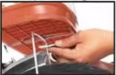
15. Place the bottom iron plate in the slot