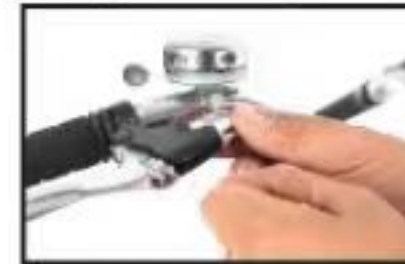
19. Tighten the brake cable and loosen the front