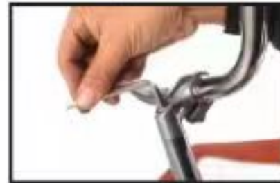
18. Install screws in place