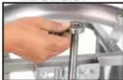
28. Load bearing