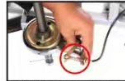
25. Adjust brake to tightest position after pinching