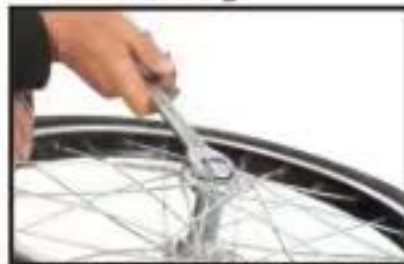
35. The square hole jammed square slot of rear axle