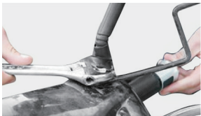
Twist the review mirror

Put the bracket into the rearview mirror; then tighten rearview mirror again, finish.