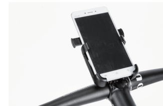
Just press the center of the phone